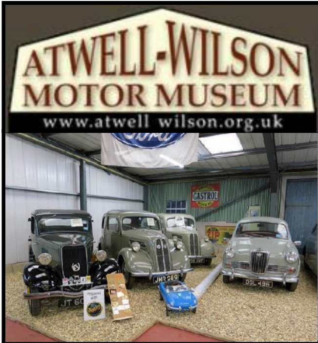
The AGM will be held at the Atwell Wilson Motor Museum near Calne