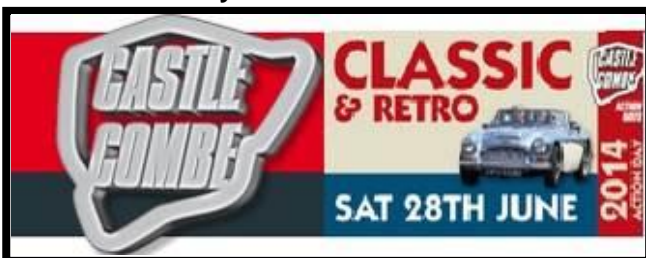
Meet on Saturday 28th June at the Castle Combe Classic & Retro Action Day