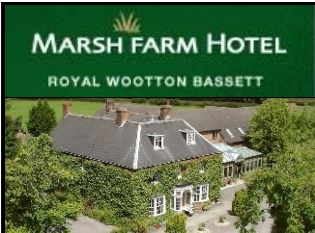
The AGM Weekend Dinner will be held the night before the AGM at Marsh Farm Hotel near Royal Wootton Bassett